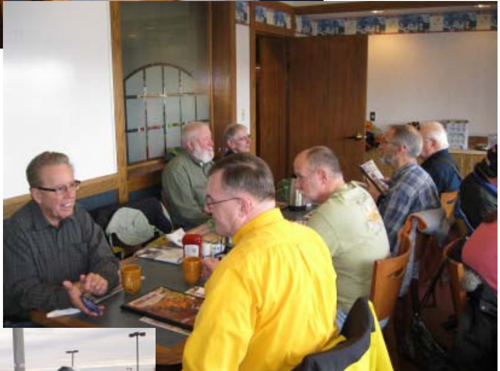
MORE PICTURES BY REDDYK