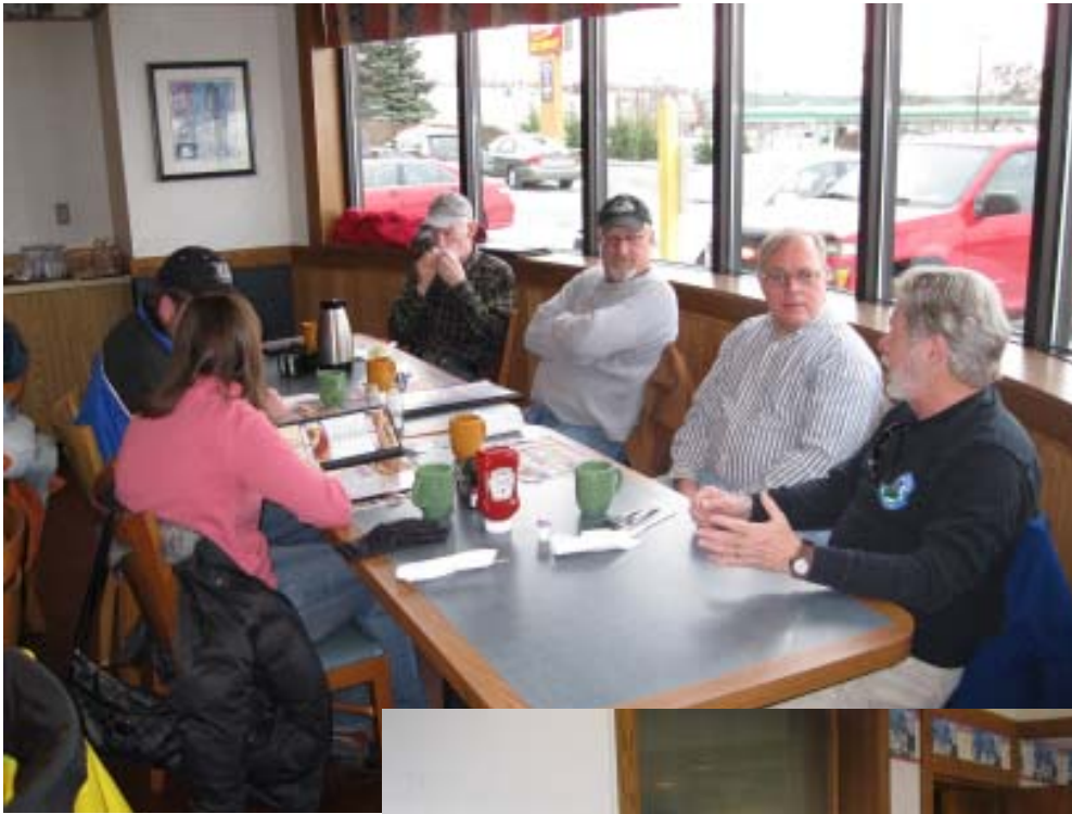
OF KING'S DELICIOUS INTERIOR