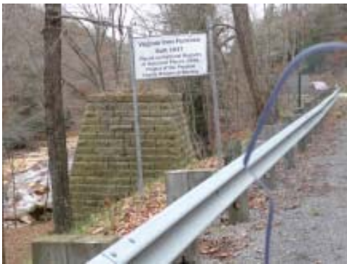
The Wharton Iron Furnace